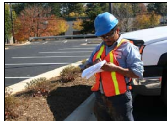
6. Complete paperwork and record plant height and width

For additional information please contact your local Filterra sales representative. Eastern Zone: 866-349-3458, Western Zone: 877-345-1450.