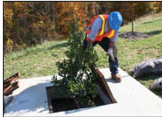
2. Removal of tree grate and erosion control stones