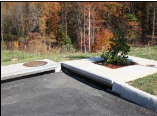
1. Inspection of Filterra and surrounding area