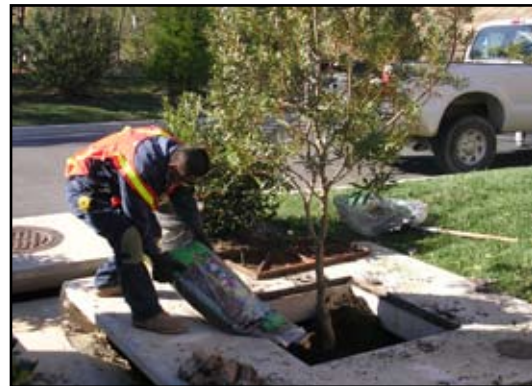
4. Mulch replacement