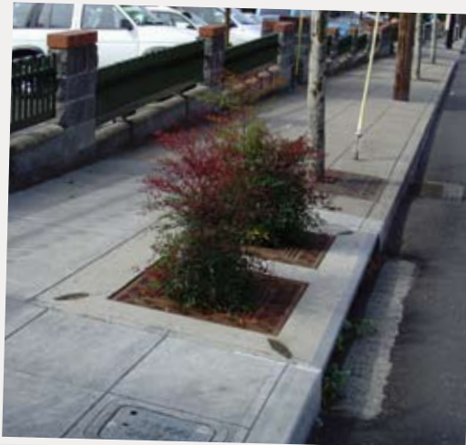
The use of plants and decorative tree grates enhances the appearance along the city street.