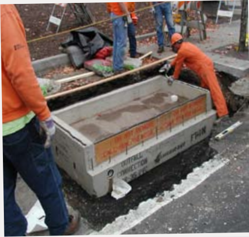
Drop-in-place constructions allows for simple installation in compact locations